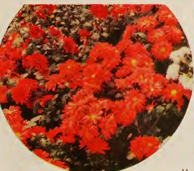
ROUGE CUSHION. 60c each; 3 for $1.50